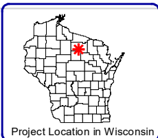
Project Location in Wisconsin