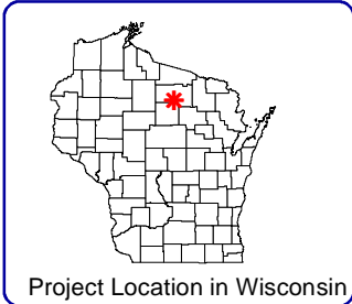
Project Location in Wisconsin